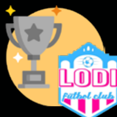
U12 LODI FC LODI, CALIFORNIA