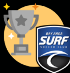
U13 BAY AREA SURF BAY AREA, CALIFORNIA