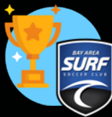
U11 BAY AREA SURF BAY AREA, CALIFORNIA