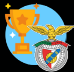
U13 SPORT LISBOA BENFICA LISBON, PORTUGAL