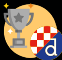
U14 GNK DINAMO ZAGREB ZAGREB, CROATIA