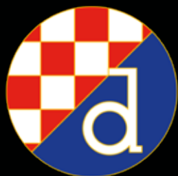
GNK DINAMO ZAGREB CROATIA

In its inaugural edition, the California Youth Cup 2024 made history by attracting six international clubs to compete and learn about our region. Each club and some of its players had experienced the American culture for the first time, plus the experience of being in the soccer community with other local clubs. The following are the foreign teams who participated in our first-ever soccer cup: